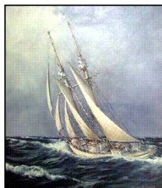
Chart A Winning (Business) Course

Planning for business success is little more than thinking strategically about the future of your business.